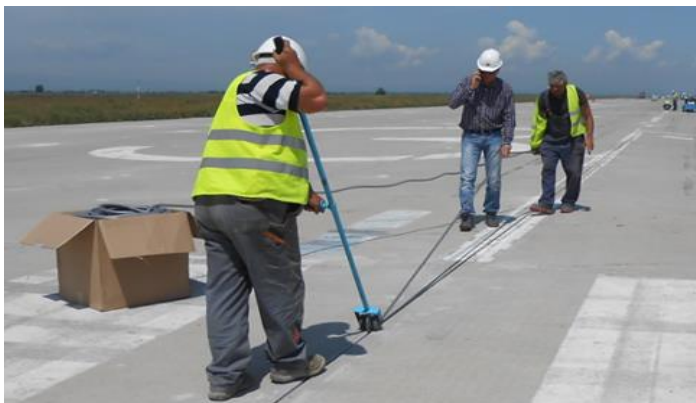
Picture1: Application of the backing rod with a tool

Check the depth of the backer rod as calculated in accordance with Section 3. Remember to consider both the sealant depth (thickness) and the sealant recess when determining the backer rod depth. To prevent leakage of sealant during application, backing must be tight e.g. sometimes it's necessary to seal crossings of the backer rods with a non-sag sealant like Sikaflex PRO-3.